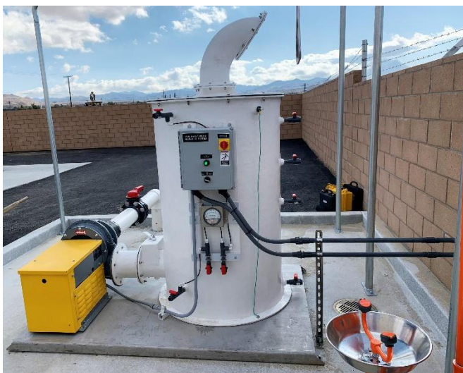
IMS Modular Carbon Odor Control System (MCS-0300) installed at the Paxton Pump Station at the Intersection of Paxton & Balsa Ave

The exhaust fan operates continuously and pulls foul air from the process area through the collection ductwork into the carbon adsorber odor control system for treatment prior to release to the atmosphere. A volume control damper is placed at the system inlet to allow regulation of airflow through the carbon adsorber.