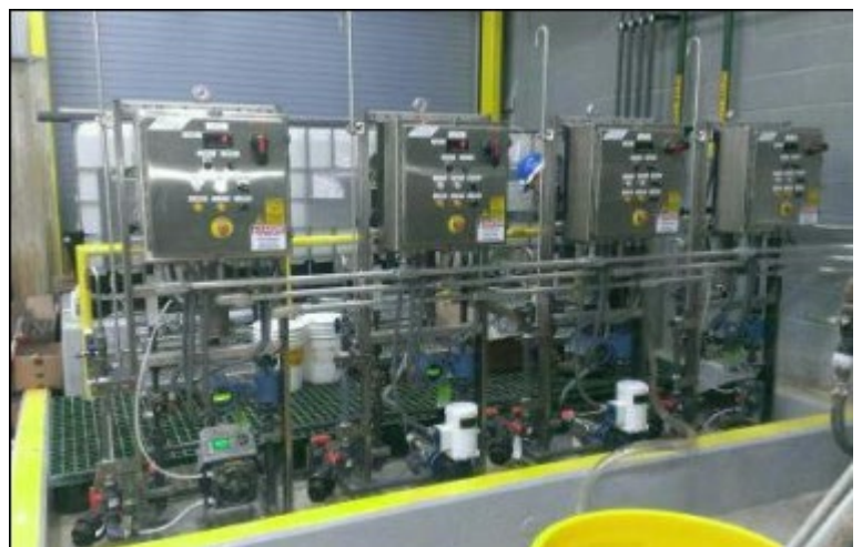
Dynablend™ polymer feed equipment with controls

The company installed four Dynablend™ L4S-300 liquid emulsion polymer feed systems employing a unique pump configuration to fit the specific application. Two skids contained peristaltic pumps, each with a 4.6 gph capacity, and two skids contained progressive cavity pumps with capacities ranging from 6 to 10 gph. All four of the skids included the latest control technology from Cleanwater1. The inclusion of magnetic flow meters and sensors, combined with SCADA capabilities, meant the entire polymer feed process could be automated and monitored remotely. The control technology included remote on-off, pacing signal for speed adjustment of the polymer feed pump, alarms for low water and low polymer flow, running indicator, pump rate indicator, water rate indicator, and solution concentration indicator.