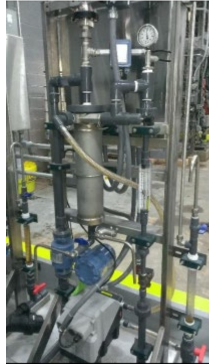
Dynablend™ skid and mix chamber

To access our full assortment of case studies, data sheets, brochures and more, visit our document library at https://documents.cleanwater1.com or scan the QR code.